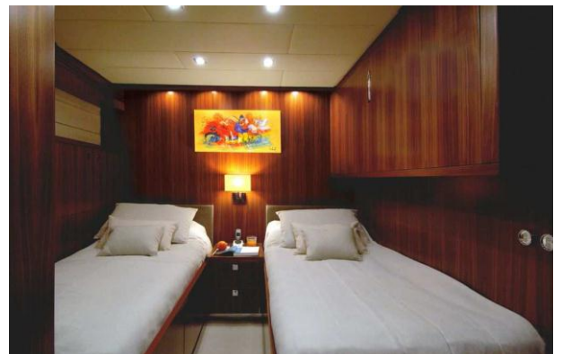
guest room /with pullman