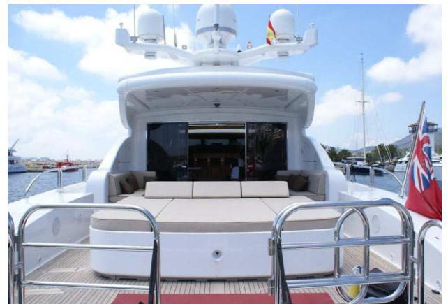
stern view / entrance