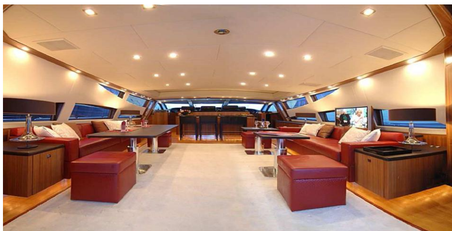
salon / dining with bar

Contact: Fredy Link – Tel. +34 971 19 34 84 / +34 670 33 20 55 // +41 71 244 14 00 /+ 41 79 600 2200 // email: info@fredy-link.com