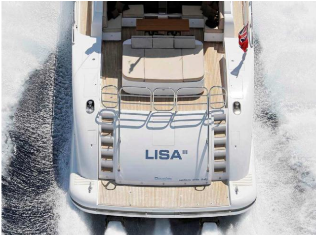
Sun deck / swimm platform

12-14 Finch Road Douglas IM99 1TT - Isle of Man